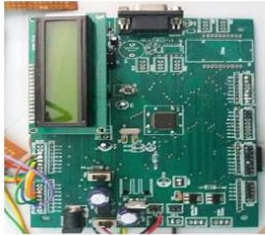
Fig 2. ARM7 LPC2148