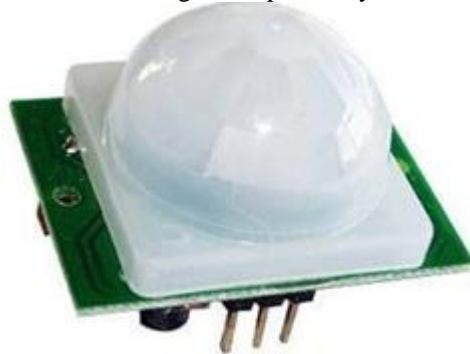
Fig 3. PIR sensor

A passive infrared sensor (PIR sensor) is an electronic sensor that measures infrared (IR) light radiating from objects in its field of view. They are most often used in PIR-based motion detectors. PIR sensors are incredible, they are flat control and minimal effort, have a wide lens range, and are simple to interface with. A PIR or a Passive Infrared Sensor can be used to detect presence of human beings in its proximity.