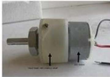
Fig 5. Bi-directional linear DC Motor

Dc motors are increasing in popularity due to their performance advantages over ac motors. Advantages of DC motors include Speed control over a wide range both above and below the rated speed, High starting torque- have a starting torque as high as 500% compared to normal operating torque, Accurate steep less speed with constant torque, Quick starting, stopping, reversing and acceleration, Free from harmonics, reactive power consumption and many factors which makes dc motors more advantageous compared to ac induction motors.