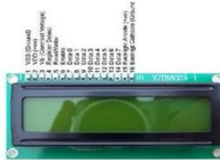
Fig 4. LCD display