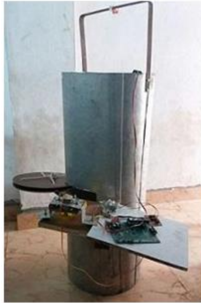
Fig 6. Bore well rescue system